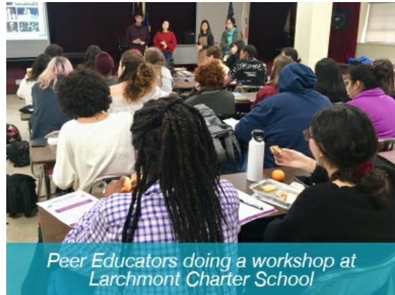
Peer Educators doing a workshop at Larchmont Charter School