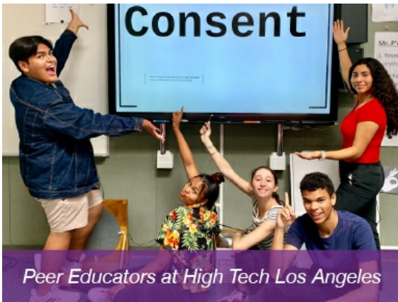
Peer Educators at High Tech Los Angeles

SAVE THE DATE for our Open House on September 11, 2019, at 6 pm. Our Open House is a networking opportunity to meet the Change the Talk staff, see a portion of our workshop, and participate in activities that are used during our training. You will also get the opportunity to meet our Peer Educators and inquire about their experience with Change the Talk! The Open House is a perfect time to learn how to host a workshop or training at your school. You can also click here to bring us to your school or youth group in the Fall!