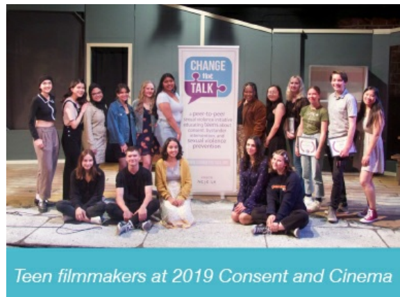
Teen filmmakers at 2019 Consent and Cinema